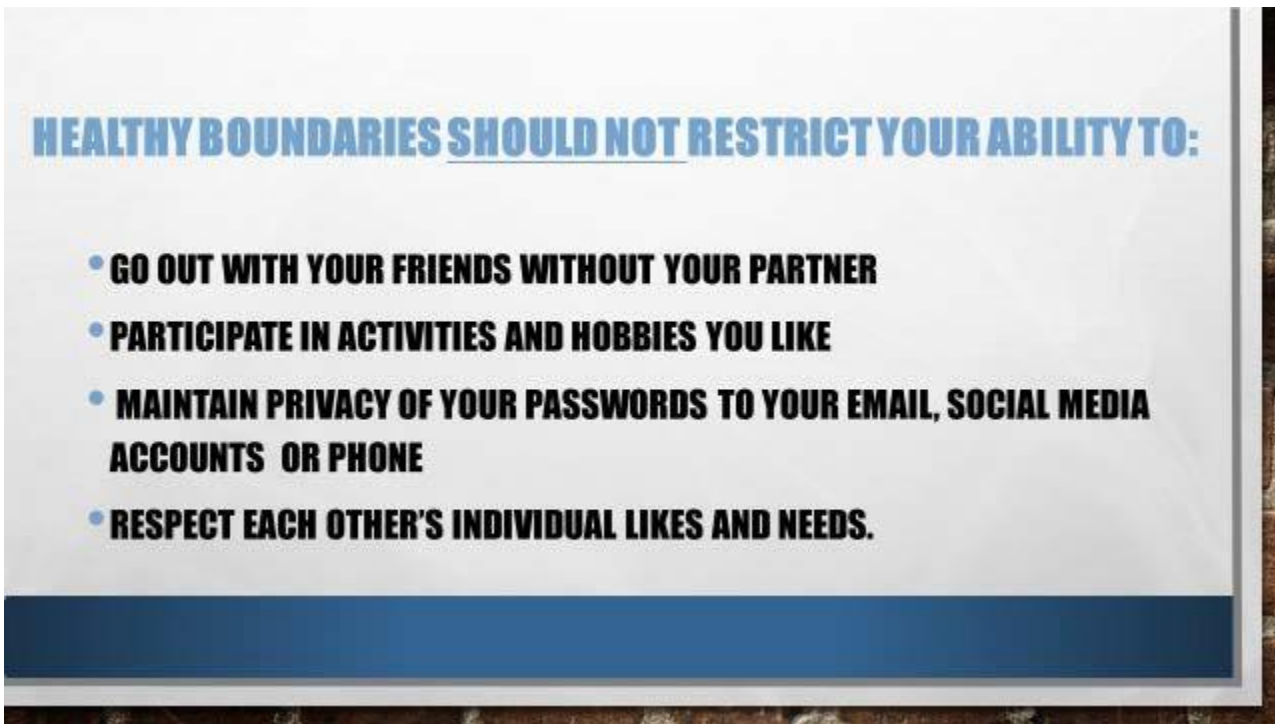
Slide 9: Healthy or Unhealthy Activity