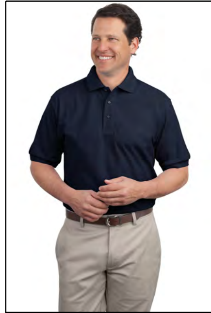
Port Authority® - Silk Touch™ Sport Shirt. K500

Sizes: XS-XL $18.00; 2XL $19.00; 3XL $20.00; 4XL $21.00