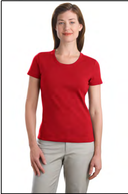
Port Authority® - Ladies Modern Stretch Cotton Scoop Neck Shirt. L516C

Women of all shapes will appreciate our Modern Stretch Cotton Collection. With an updated fit and figure-flattering details, the extra soft cotton is combined with a dash of spandex to retain shape and make the most of yours. We've added extra length throughout the body for clothes that move with you for exceptional comfort all day long. Our updated scoop neck will revive your wardrobe options.