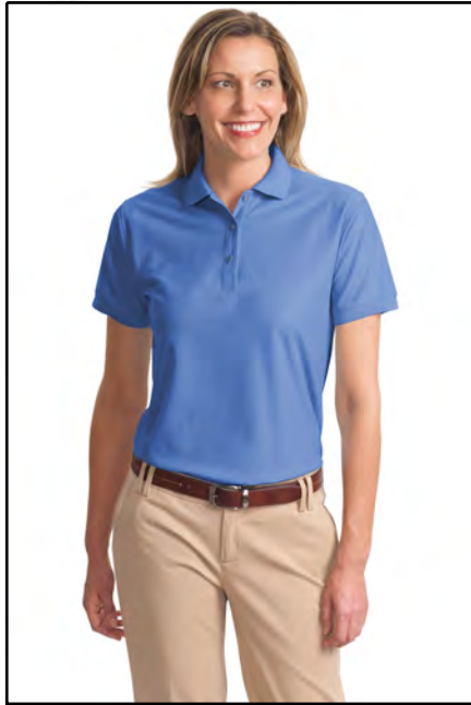
Port Authority® - Ladies Silk Touch™ Sport Shirt. L500

An enduring favorite, our comfortable classic sport shirt is anything but ordinary. With superior wrinkle and shrink resistance, a silky soft hand and an incredible range of styles, sizes and colors, it's a first-rate choice for uniforming just about any group.