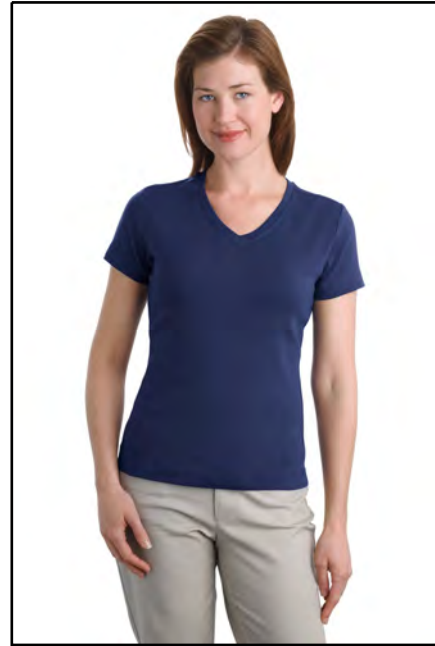
Port Authority® - Ladies Modern Stretch Cotton V-Neck Shirt. L516V

Sizes: XS-XL $20.00; 2XL $21.00; 3XL $22.00; 4XL $23.00