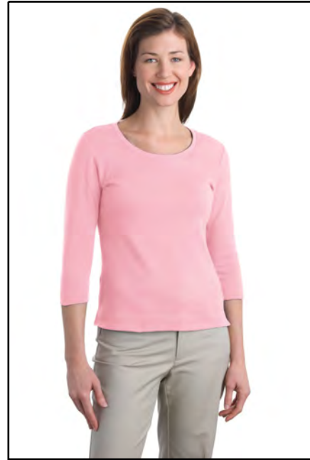
Port Authority® - Ladies Modern Stretch Cotton 3/4-Sleeve Scoop Neck Shirt. L517

Sizes: XS-XL $22.00; 2XL $23.00; 3XL $24.00; 4XL $25.00