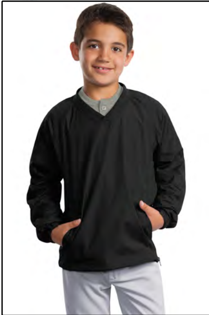
Sport-Tek® - Youth V-Neck Raglan Wind Shirt. YST72; Adult Wind Shirt JST72 (Men and Women)