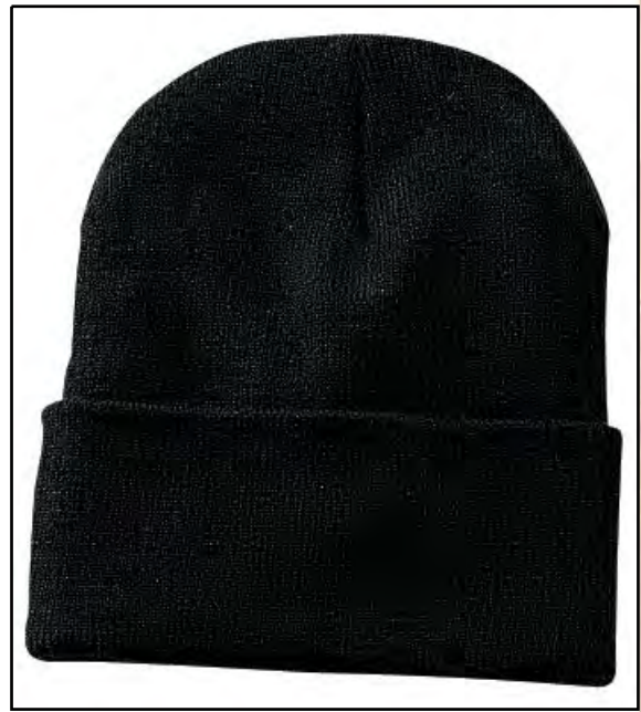
Port & Company® - Knit Cap. CP90

Youth Sizes: XS-XL $18.00 Adult Sizes: XS-XL $18.00; 2XL $19.00; 3XL $20.00; 4XL $21.00