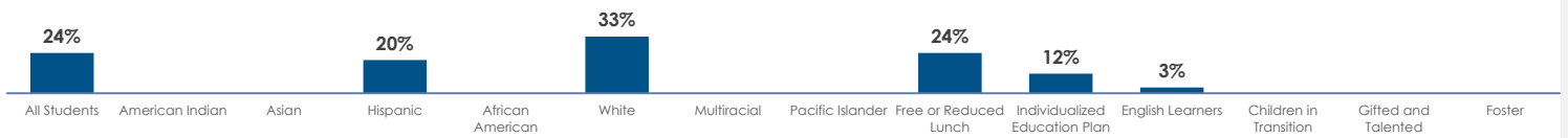
English / Language Arts: Percentage achieving "At or Above" standard (2022-2023): 24% - All Students, * - American Indian, * - Asian, 20% - Hispanic, * - African American, 33% - White, * - Multiracial, * - Pacific Islander, 24% - Free or Reduced Lunch, 12% - Individualized Education Plan, 3% - English Learners, * - Children in Transition, * - Gifted and Talented, * - Foster