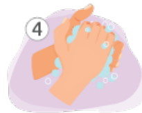
4 Between fingers