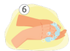
6 Under nails