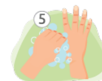
5 Base of thumbs