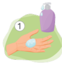
1 Wet hands with water. Apply soap.