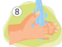
8 Rinse in running water.