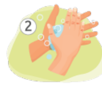
2 Scrub for 20+ seconds or sing ABCs.