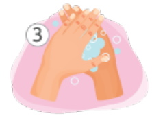
3 Palms and back of hands