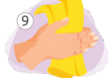
9 Dry with clean towel. Use towel to turn off faucet and open door.