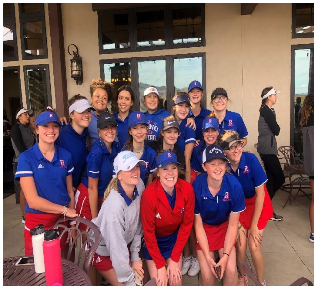
Girls Golf having a great season