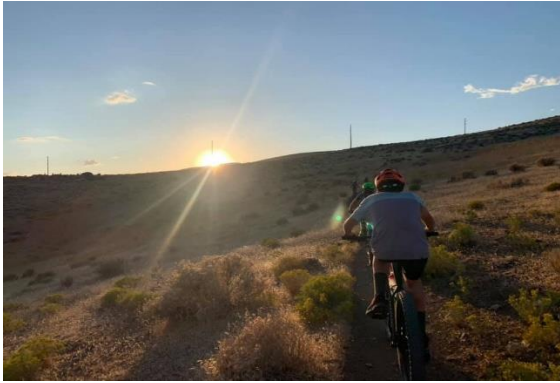
Reno High Mountain Biking Club pic

College Application/Scholarship season is upon us!