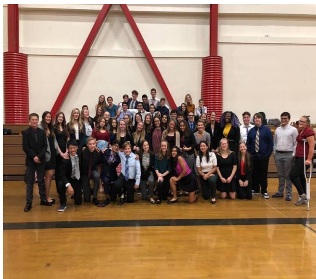
Speech and Debate kicked off last month