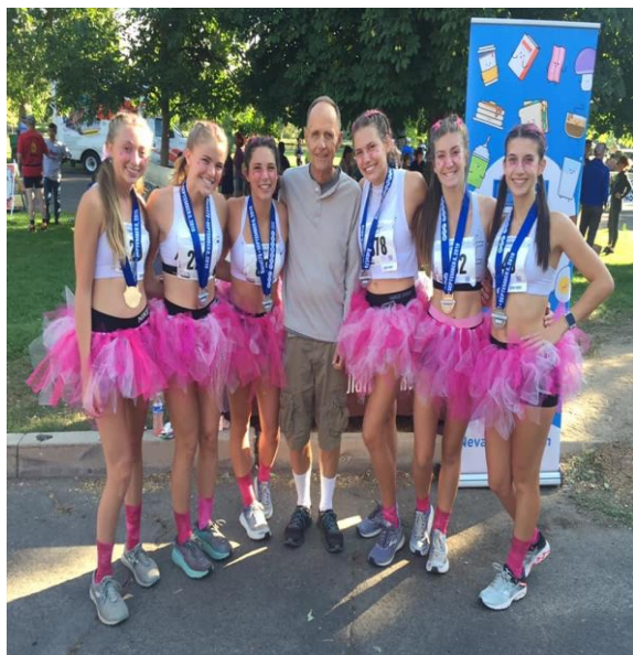
Cross Country helping at Journal Jog