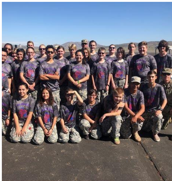
JROTC helping at the Air Races